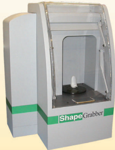
The ShapeGrabber Ai310 scanning an ear thermometer.

Rapid and efficient inspection scans also reduce production equipment downtime, material waste, and human inspection error.