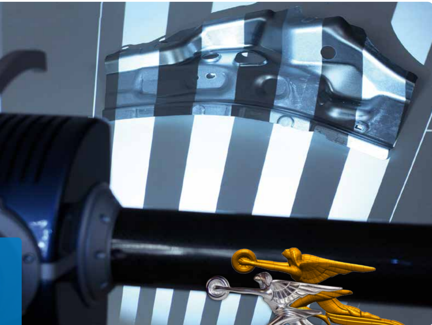
Fast and precise 3D scanning thanks to patented miniaturized projection technique (MPT)